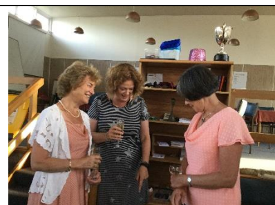
3. We're not looking!